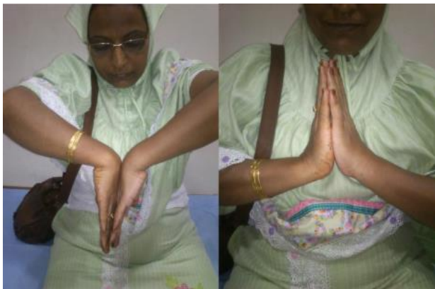
Figure 4: Post op picture showing ROM

In 14 patients (38.90%) fracture got united within 10 weeks of time. The range of union time varied from 6 weeks to 14 weeks. The average mean for the sample of 36 patients worked out to be 9.53 weeks. Out of 36 patients, 1 patient (2.80%) required implant removal because of pain due to longer screw at dorsum of wrist.