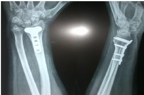
Figure 3: Post op x ray showing union

The results of radiological evaluation revealed that on the final follow up, our patients achieved 9.61 mm mean radial length, 4.22° average volar tilt and 21.53° of average radial inclination.