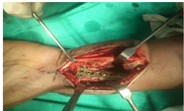
Figure 2: Final position of plate