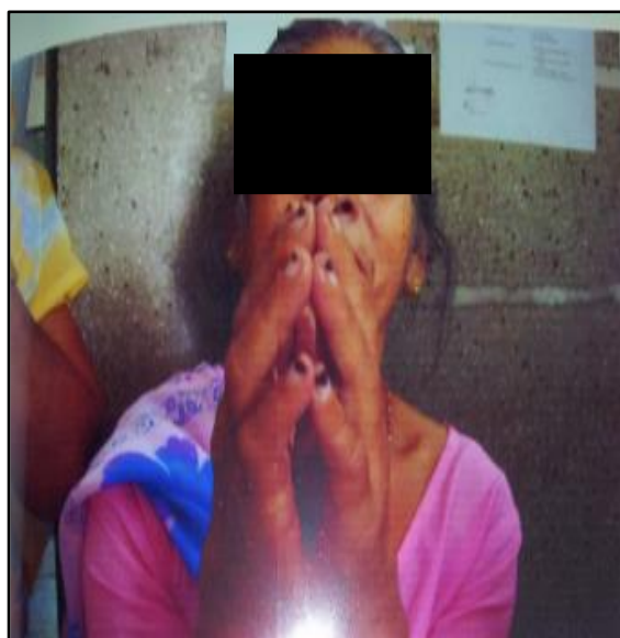
Fig. 3: Diabetic Hand Syndrome

Diabetic cheiroarthropathy (limited joint mobility, diabetic stiff hand, diabetic contractures) initially called as stiff hand syndrome was first described in 1957 in young diabetic patients, (Lundbaeck et al, 1957). 8 It is characterized by stiffness of small joints of hands and at other sites. Diabetic hand syndrome (DHS) was seen in 12% of study population. Douloumpakas et al, (2007) showed that overall prevalence of diabetic hand syndrome in type 2 diabetes mellitus was about 8%. According to Sarkar et al diabetic hand syndrome was seen in 13.1% of diabetics but was not observed in the non-diabetic group. 3