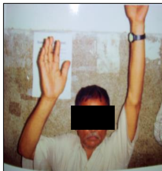
Fig. 2: Adhesive Capsulitis

Osteoarthritis also called as degenerative joint disease, is the most common rheumatic disease in the general population. It may be asymptomatic or mild, but severe involvement leads to pain, stiffness, and limitation of motion in the affected joints, most commonly involving the knees, hips, and spine, and may be a source of major disability and morbidity. Several studies have suggested that the prevalence of osteoarthritis is higher in young and middle-aged diabetic patients and that joint damage starts at an earlier age and is much more severe in diabetic than in control patients (Husni et al). 6 Although insulin may alter the extracellular matrix present in bone and cartilage, the significance of such