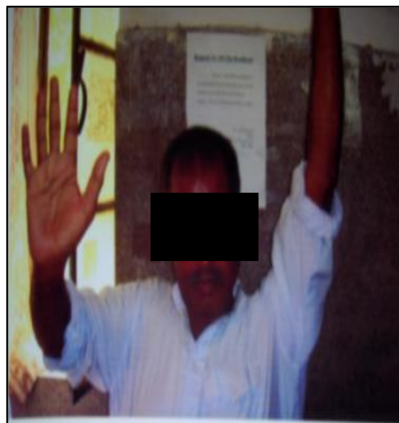
Fig. 1: Adhesive Capsulitis

capsulitis and diabetes mellitus has been well documented. Bridgman et al (1972) identified adhesive capsulitis in 11% of 800 diabetic patients as compared with an incidence of 2.5% in 600 control patients. In our study 52% of the patients of type 2 diabetes mellitus with rheumatological manifestations had adhesive capsulitis/frozen shoulder. 5