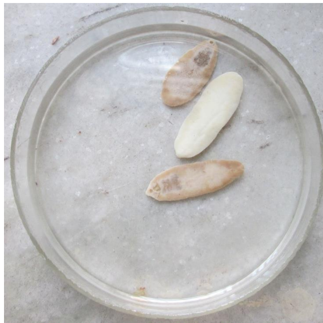
Fig 2: Adult worm of Fasciolopsis buski recovered from the vomiting.

Reports of F. buski infestation in India have been mainly done from Bihar, Uttar Pradesh, and Maharashtra and sporadically from other states like Assam and West Bengal 5 . Fasciolopsiasis seem to be restricted to areas where water vegetations such as water chestnut, water caltrops, water bamboo are eaten abundantly especially if consumed uncooked. Most cases of Fasciolopsiasis are asymptomatic.