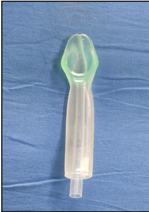
Figure 2: I-gel™