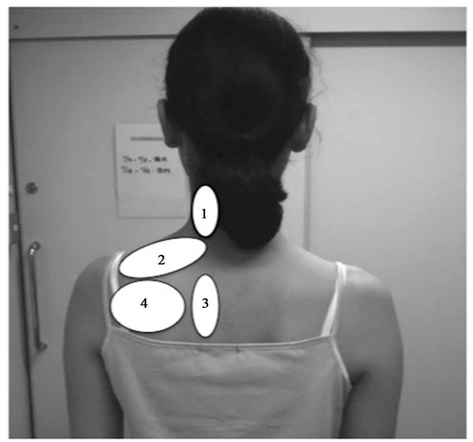
Fig 1: The location of neck and shoulder stiffness classified in accordance with the JOA Katakori project.<sup>20</sup> In this report, the location was divided into the following four places: 1: Neck, 2: Above the scapula, 3: Interscapular area, and 4: On the scapula.

By visual analogue scale (VAS), score of pain were rated from 0 to 100 in all subjects, where 0 signify no pain and 100 indicating the worst possible pain. The Subjects were divided into two groups, normal group and pain group by VAS results. The VAS score of the normal group was 0, and other results were included in the pain group. Subjects with a VAS score of 0 confirmed that they had not felt pain for >1 month. The location of pain was classified in accordance with the JOA Katakori project.<sup>19</sup> In this report, the location was divided into the following four places: neck, above the scapula, interscapular area, and on the scapula Fig 1.