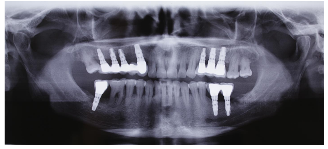
Fig 2: Follow-up Panoramic View