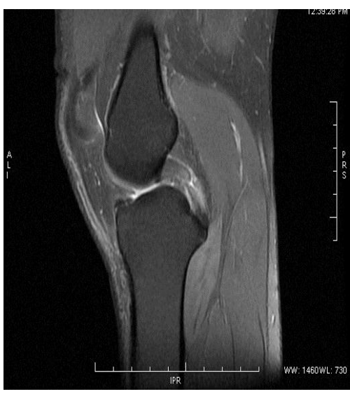
Fig 3: PCL tears; Sagittal FAT SAT MRI KNEE Image Showing High Signal Intensity In Posterio Cruciate Ligament With Intact Fiber Suggesting partial Thickness Tear