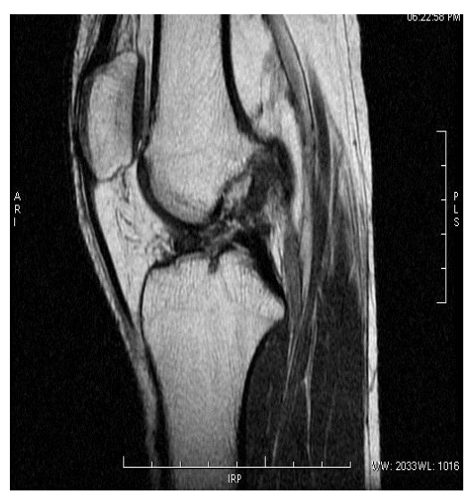
Fig 1: Sagittal STIR Image Showing Heterogenous Signal Intensity in Anterio Cruciate Ligament With Discontinuty of Fibers Complete Tear of ACL

In 21 patients with anterior cruciate ligament tears, hyper intensity in the ligament was seen in 17 patients (80.9%). Non-visualization of A was found in 4 patients (19.1%). (Fig 1)