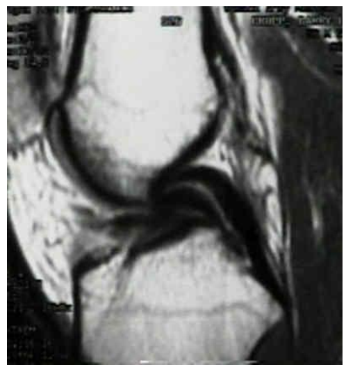
Fig 4: Sagittal PDIMAGE Showing Double PCL Sign Seen In Bucket Handle Tear Of Medial Meniscus.

one case fragment in notch sign was seen. In the study of Cruse JV III fragment in notch sign seen more (66%) than double PCL sign (53%) involving medial meniscal tear.<sup>8</sup>