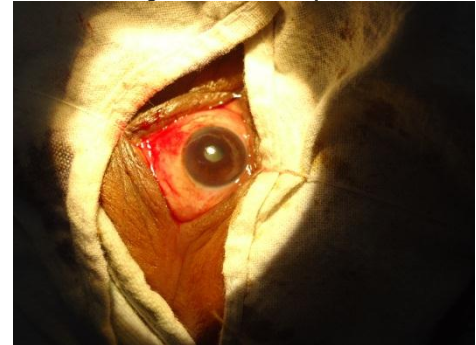
Fig 10: Successful NPGS implant