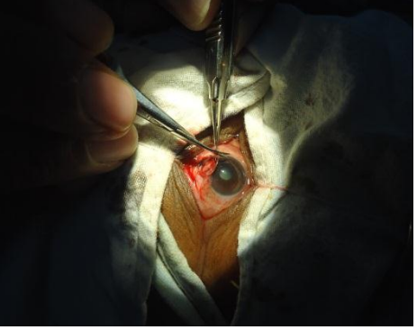
Fig 6: Preparation of implant