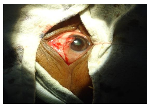
Fig 1: Preparation of superficial scleral flap