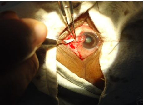
Fig 2: Preparation of deep scleral flap