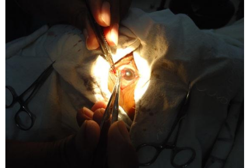
Fig 9: Suturing of scleral and conjunctival flaps