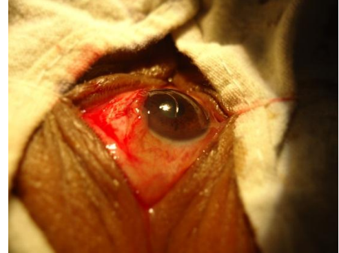
Fig 7: Prepared implant for NPGS