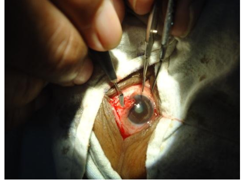
Fig 5: Preparation of side pocket to fix the implant