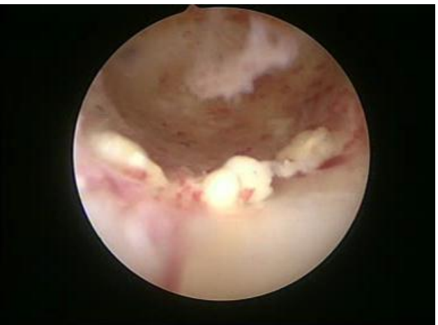
Fig 5: Small chips of impacted bone fragments in the posterior wall.