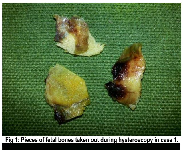
Fig 1: Pieces of fetal bones taken out during hysteroscopy in case 1.