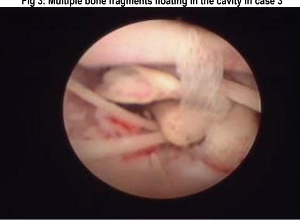
Fig 4: A cluster of bones seen in Case