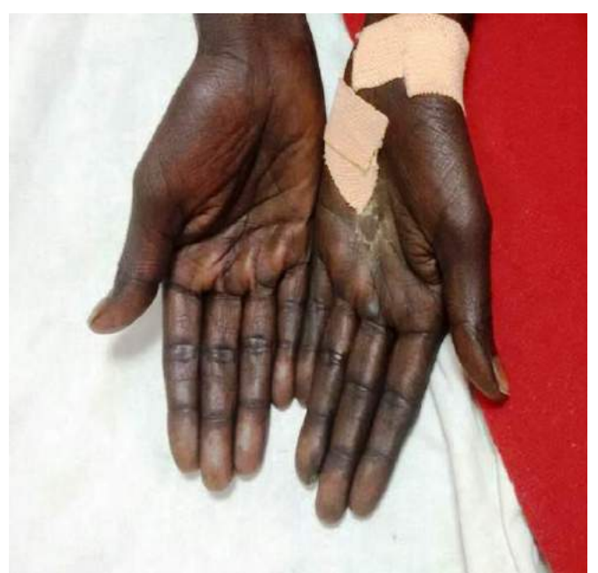
Fig 1: Generalised hyperpigmentation of the entire body, with darkened palmar creases

Testosterone and Gonadotrophins (FSH/LH) were within normal limits; there were no clinical signs suggestive of hypogonadism. Anti-GAD 65 (Glutamic Acid Decarboxylase) and Anti tTg-IgA (anti tissuetransglutaminase) antibodies were undetectable. Serology for HIV, Hepatitis B & C antigens was negative.