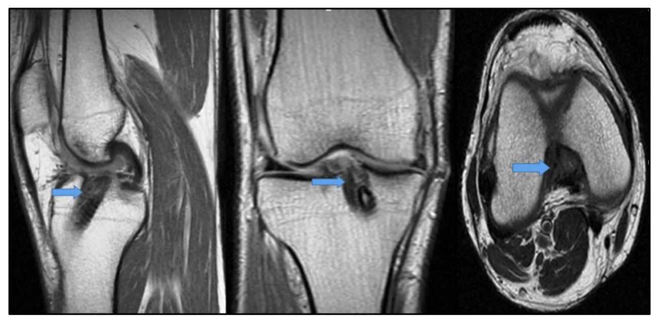
Figure 2: Sagittal intermediate-weighted, Coronal intermediate-weighted and axial T2-weighted MR Images, MR Image shows increased signal intensity within the ACL reconstruction graft(blue arrow).