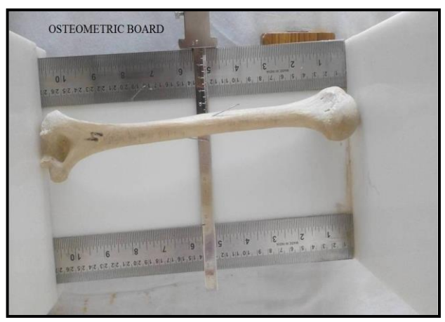
Figure 2: A photograph showing osteometric board, number, location and direction of nutrient foramen.

From the above table, it was concluded that the majority (54.95%) of the nutrient foramina were located on the antero-medial surface of the shaft of humeri. Next in the order are Medial border (19.78%), anterolateral surface (12.08%), posterior surface (12.08%) and lateral border (1.09%).