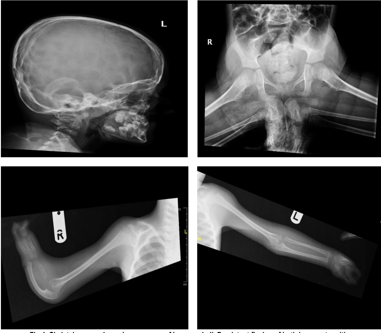
Fig 4: Skeletal survey showed appearance of lacunar skull, Persistent flexion of both lower extremities and bilateral radial deformity.