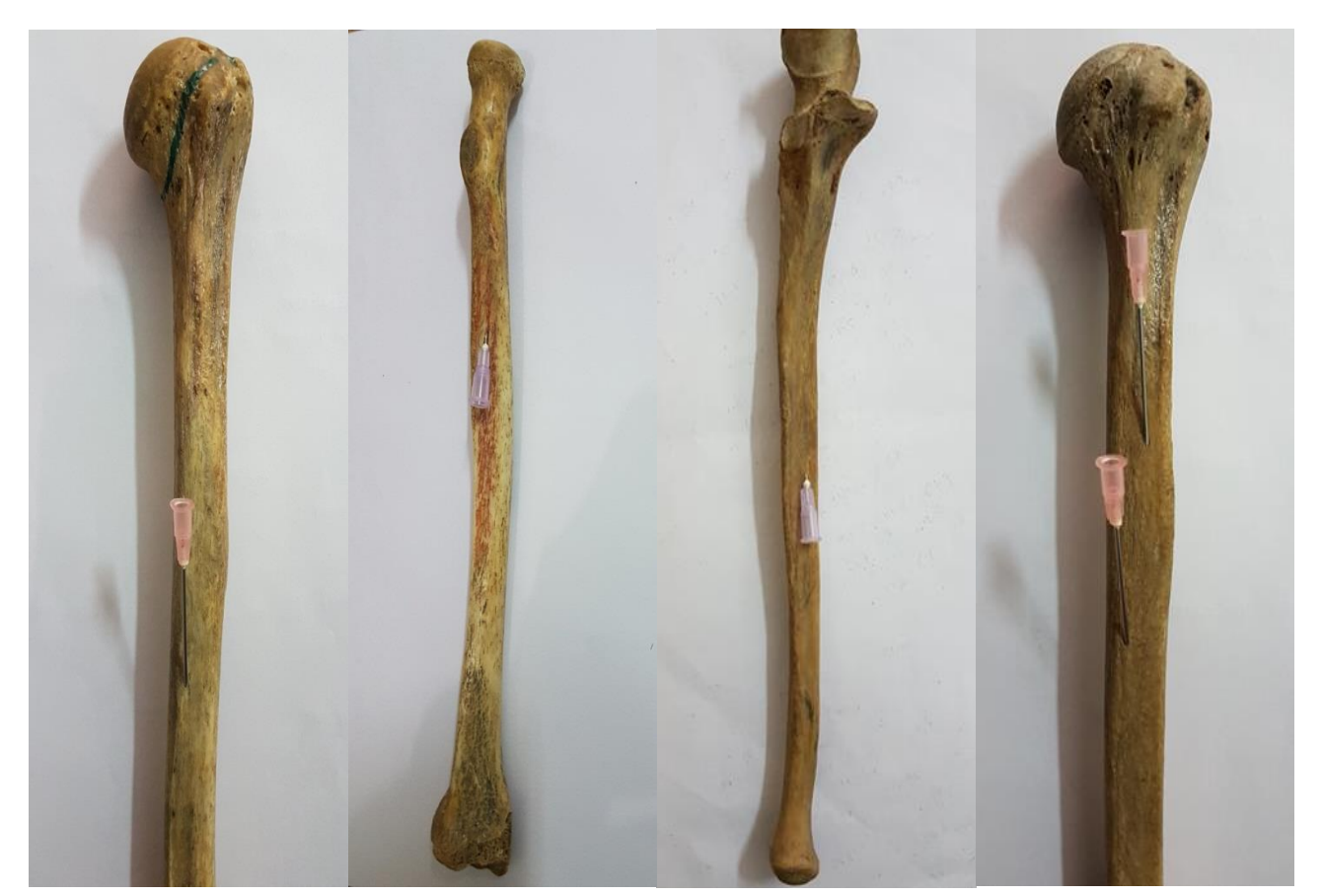
Fig 1: Anterior surface of a left humerus showing a single nutrient foramen (NF) on the anteromedial surface of the shaft as shown by the needle inserted. The nutrient foramen is located in the middle third of the bone (Type-2) and is directed downward.

Fig 2: Anterior surface of a left radius showing a single nutrient foramen (NF) on the anterior surface midway between interosseous border and anterior border of its shaft. The NF is located in the middle third of the bone (Type-2) and is directed upward.