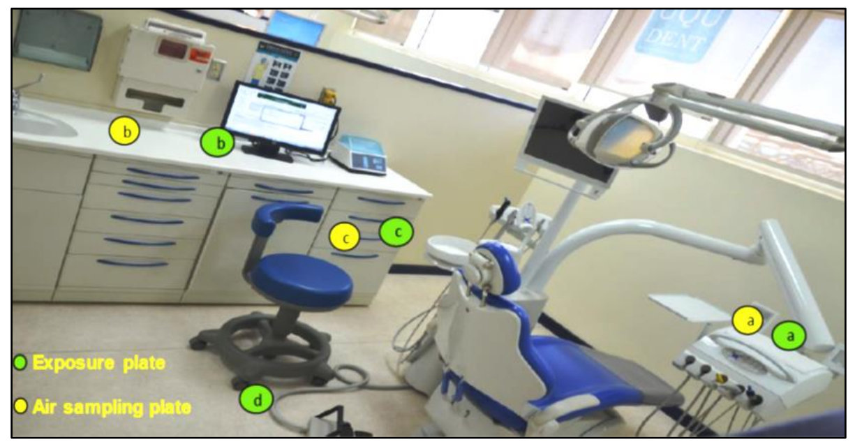
Figure 1: Exposure plates and air sampling distribution into DSC. (a) on the tray surface, (b) on the table, (c) front the dental chair, (d) beside the doctor stool. [Exposure plate site: a,b,c,d; Air sampling plate site: a,b,c]

The air samples were collected in the DSC from three locations (a) on the tray surface, (b) on the table, (c) front the dental chair, according to Lembke et al., 1981. All data was recorded and compared with the European Union standard for the air system.<sup>14</sup>