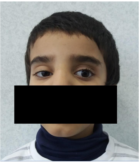
Fig 1: Showing asymmetric ptosis worse on right side