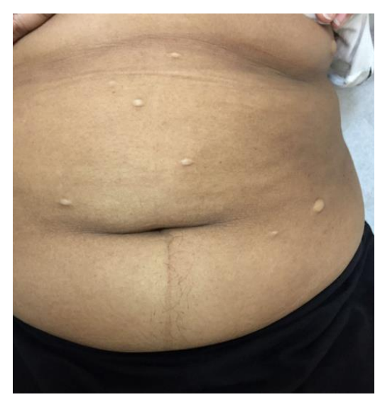
Fig 1: Multiple soft small non scaly white papules scattered on the abdomen