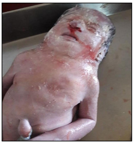
Fig 4: Non immune hydropfetal's of the newborn baby