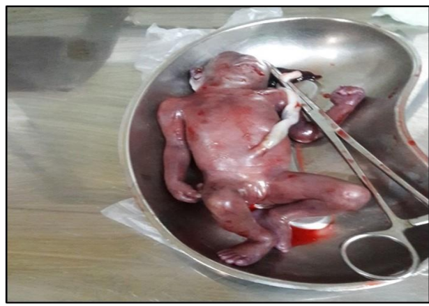
Fig 5: Anencephaly of the new born baby