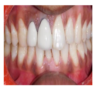
Fig 8: Postoperative Photograph