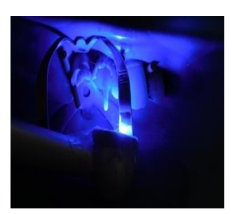
Fig:6 Light curing of the customised post