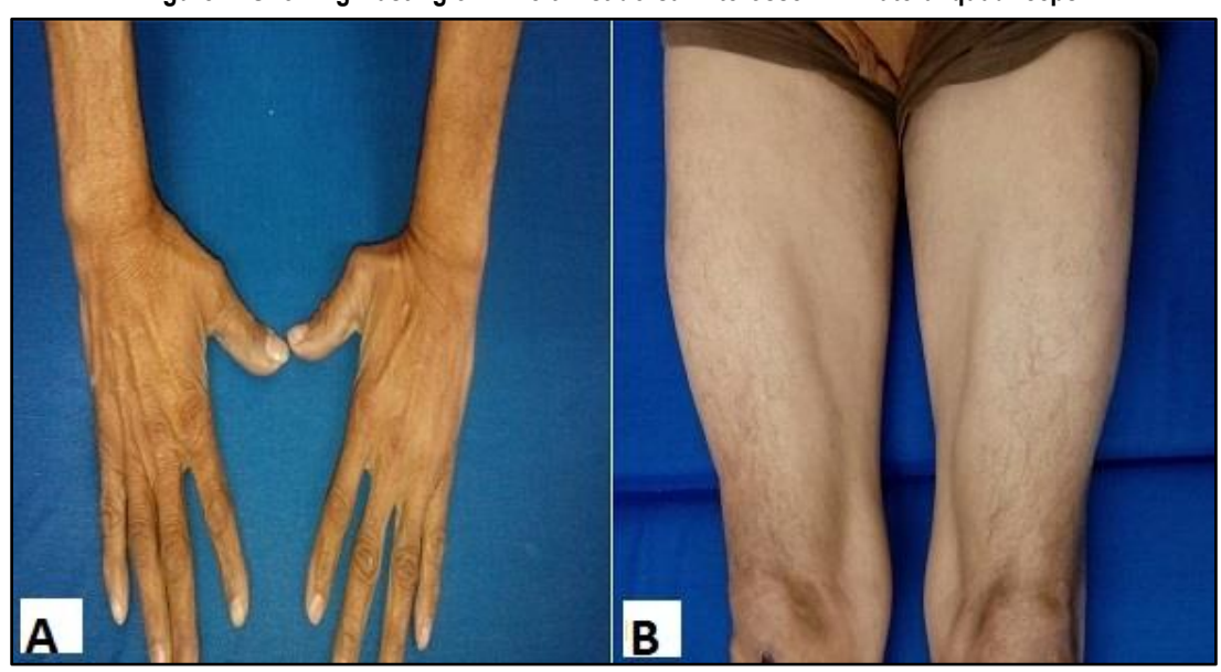
Figure 1: Showing wasting of A. Left first dorsal interossei B. Bilateral quadriceps.

On detailed family history, it was found that a total of three members were affected in the family including this patient. Patient's mother was also deaf-mute, and she developed ataxia at around 50-55 years of age. She died at 68 years of age and it was a natural death. Patient's elder brother is 75 years of age with normal hearing and speech, developed ataxia at around 52-53 years of age. He is now bedridden and not brought to this hospital, so we were not able to examine this patient. The inheritance pattern seems to be autosomal recessive (Figure 3).