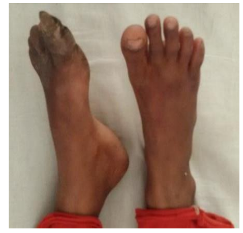
Figure 4: Foot deformity with resorption of Toes

deformities. In 6.25% of cases kyphoscoliosis was present and among them 60% had diastometamyelia and 40% had diplomyelia and these were most commonly found with tethering of cord in dorsal and dorsolumbar region. Limb length discrepancy along with thinning of limbs was present in 10% of cases. These set of patients had abnormal gait and backache which worsened on doing strenuous activity. These problems were observed most commonly in children between 10-18 yrs which corresponds to age of rapid growth.