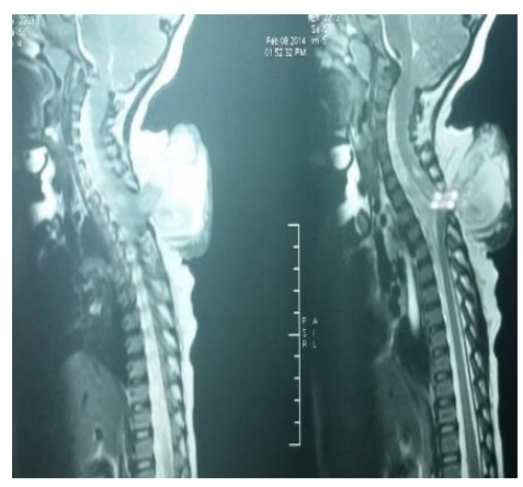
Figure 6: Dorsal meningomyeloceleradiological appearance