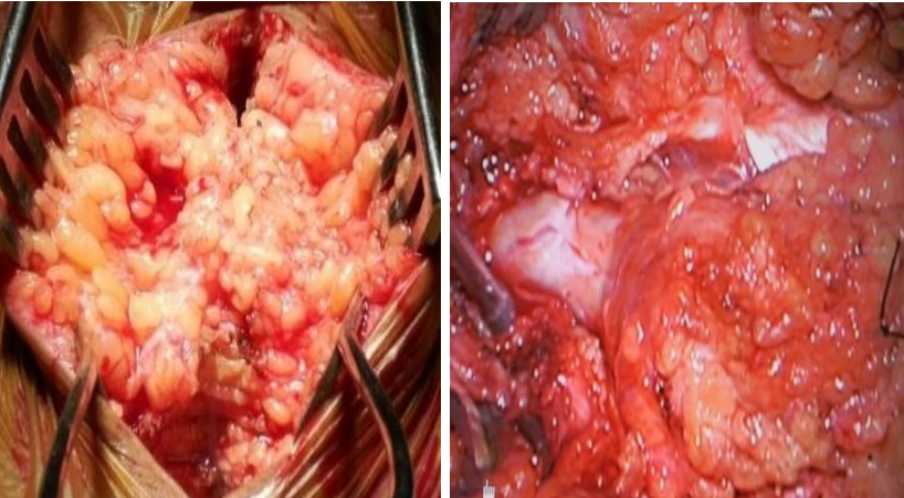
Figure 7: Diffuse lipoma (Intra-op)