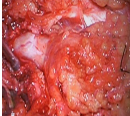
Figure 8: Intradural extension of lipoma (intra-op)