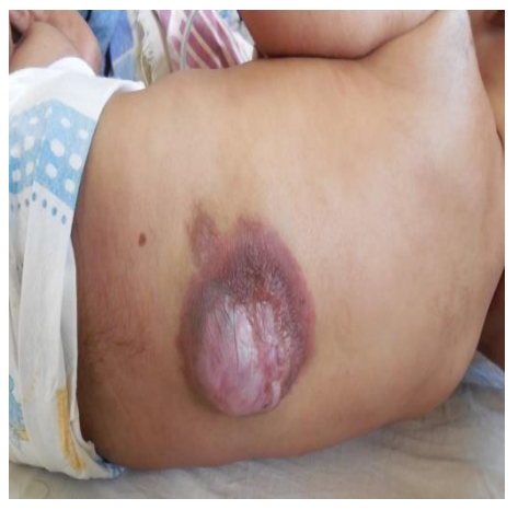
Figure 2: Dorsolumbar nevus

Among orthopedic problems 13.3% of cases had foot deformities in the form of equinus deformity, forefoot varus, club foot deformity and resorption of distal ends of toes. Recurrent ulcerations were present in 10% of cases and majorities were associated with foot