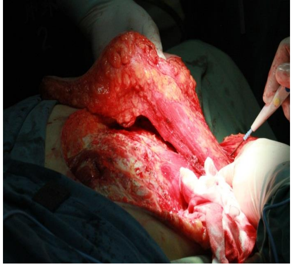
Fig 4: Intraoperative photograph demonstrating elevation of the myocutaneous pectoralis major flap