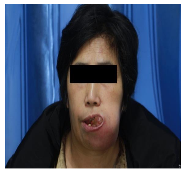
Fig 1: Preoperative photograph of the patient with mesenchymal chondrosarcoma affecting the mandible.

A single trifurcate incision was designed and the local anesthesia was administered along the lines of the neck crease. The dissection was proceeded with the blunt dissection of the subcutaneous tissue, platysma and the left submandibular gland was removed with protection of the lingual nerve and ligation of the left submandibular gland duct. The radical neck dissection was performed and the cervical lymph nodes were excised from all five