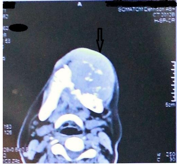
Fig 3: Axial computed tomographic scan of the patient showing extensive involvement of mandible with massive mixed radiolucent and radiopaque lesion.

levels of lateral neck as well as resection of spinal accessory nerve, sternocleidomastoid muscle and internal jugular vein was done. The lymph nodes were not adhesive, dark red and had welldefined boundaries. After a midline lip incision revealing a mass, extraction of the upper right third molar (18), upper left 1st molar (26), upper left second molar (27) and upper left third molar (28) was done. Then, resection of mandible from the left ramus till right second premolar (45) with 1 cm margin of normal tissues together with the remaining teeth, lower left lateral one third of lip, overlying skin and bilateral sublingual glands. A pectoralis major myocutaneous flap measuring 20×9 cm was raised and traversed into the neck and resected area and then sutured with complete hemostasis. The tracheotomy was performed for tracheal intubation. The specimen of 7×6×5 cm sent for histopathological examination also revealed consistent findings of MCs where majority of tumor cells showed chondrosarcoma-like differentiation yet few transdifferentiate and scattered into osteoblast-like cells. There was no metastasis in the lymph nodes and surrounding soft tissues. Until a follow up of 6 months, the patient is in good health with no obvious complications.