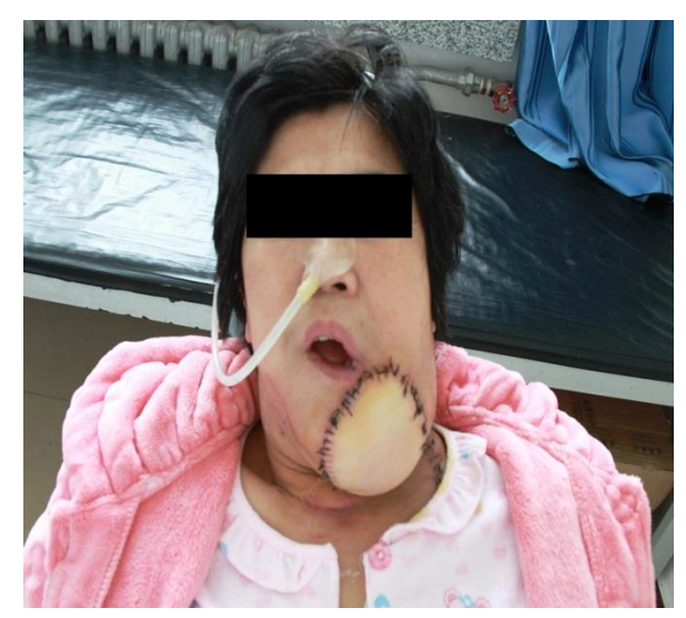
Fig 7: Postoperative photograph of the patient after reconstruction with myocutaneous pectoralis major flap.