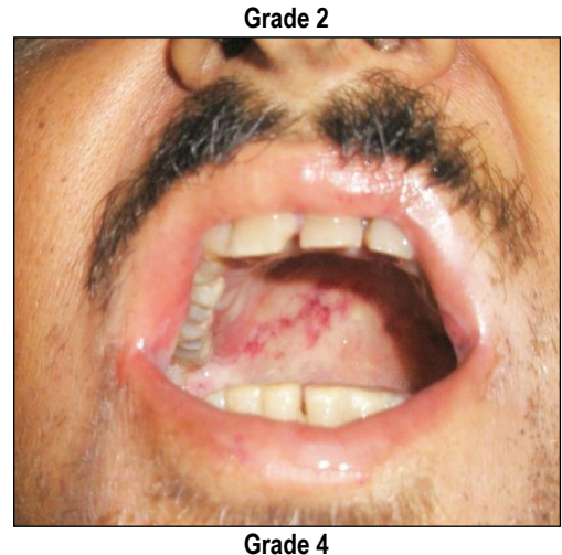
Figure 1: Various types of mucocitis