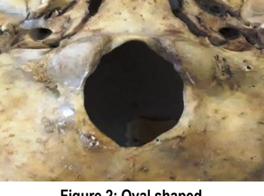
Figure 2: Oval shaped