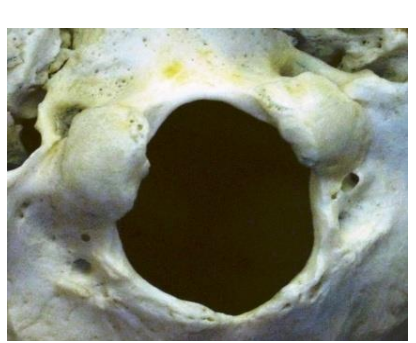
Figure 6: Irregular shaped