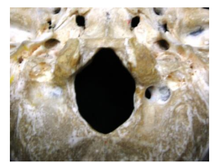
Figure 5: Hexagonal shaped