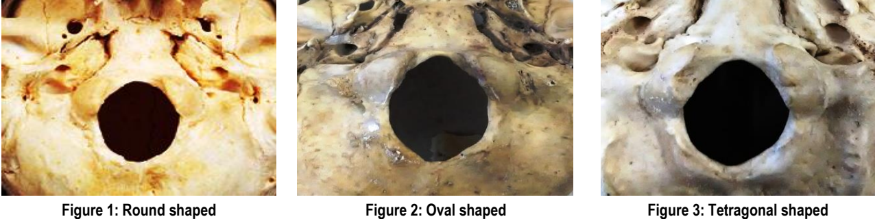
Figure 3: Tetragonal shaped

The dimensions of foramen magnum was measured by vernier caliper and the data collected were analysed statistically.