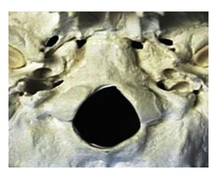
Figure 4: Pentagonal shaped