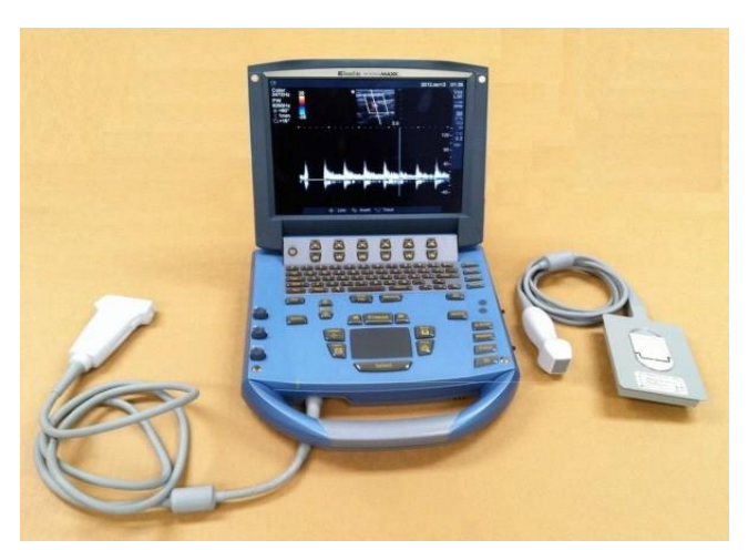
Figure1: Ultra Sound Machine

Table 1: Description of common chest ultrasonic signs