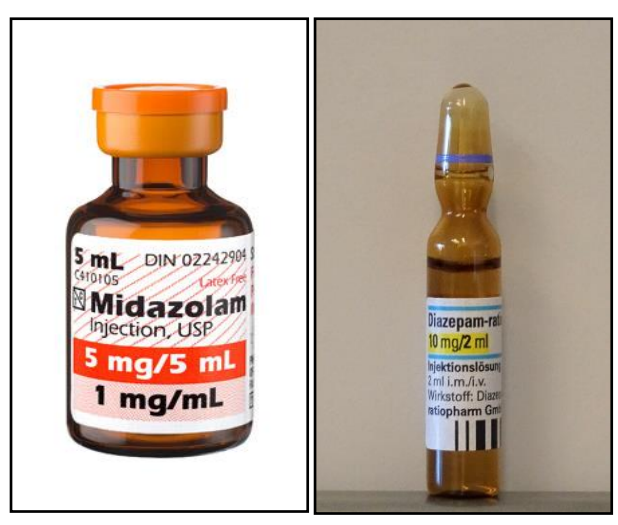
Figure 1a and 1b: Midazolam and Diazepam

pharmacological systems to diminish procedural anxiety. Thus, the everyday choice of anxiolytic premedication is as of now not evidence-based but rather reliant on the administrator's close to home inclination. As needs be, in the present examination, we decided the impacts of the benzodiazepines diazepam 5 mg/os and midazolam 7.5 mg/os contrasted and no premedication (fake treatment or placebo) on decreasing anxiety levels in patients experiencing surgery.