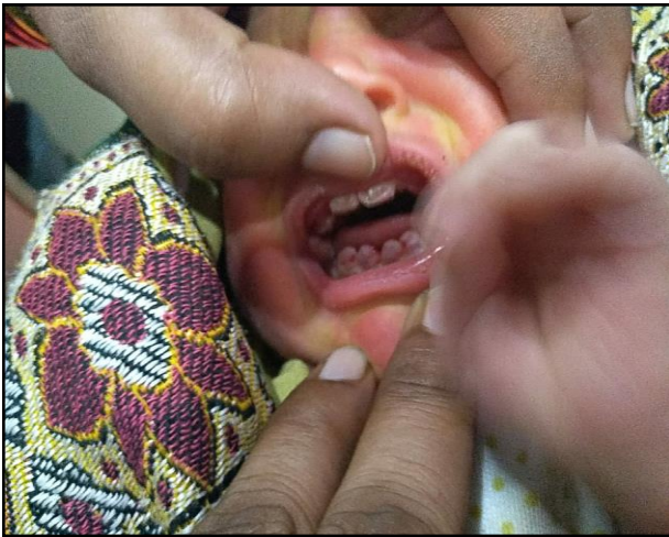
Figure 1: On intraoral examination natal teeth of an infant