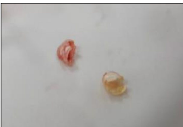
Figure 3: Image showing extracted central incisors.

On taking history from her mother it was showed that the shell-like structure was noted since the time of birth and it interfered her with feeding. The medical and family history was un-remarkable. There was no abnormality detected upon general examination. On examination intraorally, there were yellowish-white shell like with multiple morphological deciduous tooth looking like teeth of approximately 6 mm in width and 5 mm in length were seen on the alveolar ridge of maxilla and the mandible, and were mobile on palpation which attached to the soft tissues. There was no other intra-oral lesions and the tooth. Radiological investigation was not done due to the age. We advised their parent to get them extracted as these teeth because her mother was having difficulty in feeding her child. The teeth were extracted under topical anesthesia as seen in (Fig 2 and 3). Based on its appearance clinically and history it was diagnosed Natal Tooth.