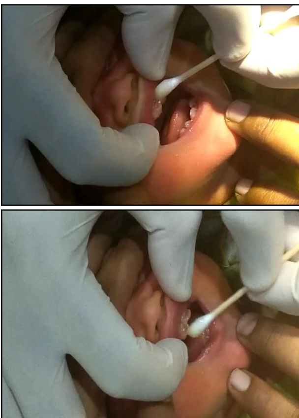
Figure 2: Application of Topical anesthesia to infant for extraction